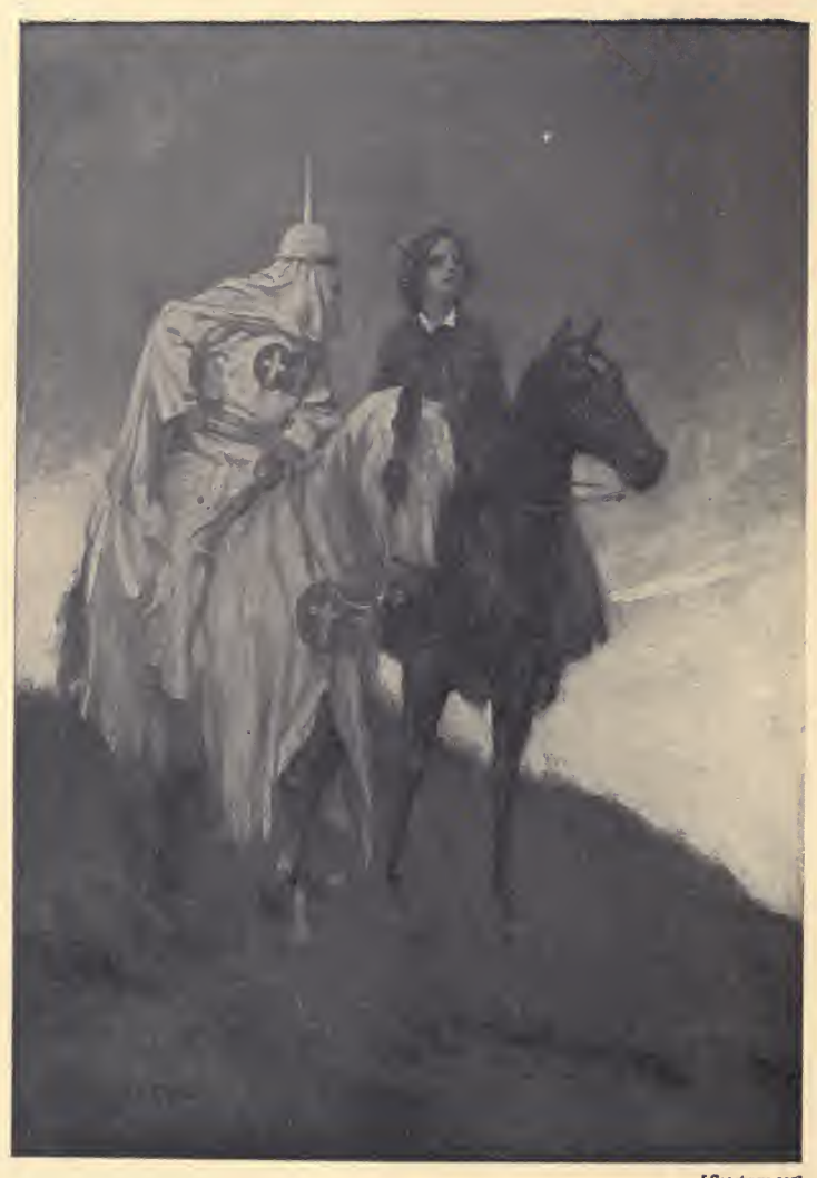
"'Do you not fear my betrayal of your secret?'" [See page 335]